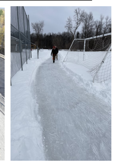
NEW—Skating Trail at Recreation Area

If you require an accessible version of this newsletter please contact the Municipal Office to obtain a copy.